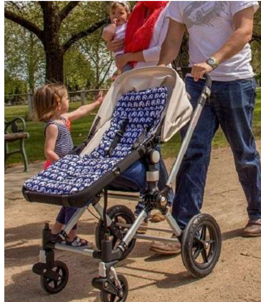
Representative photograph only.

Certified by [certifier's ref.] [licence number]